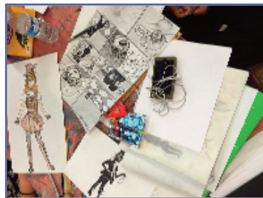
Student Art from a previous comic book design workshop

Students will explore the Elements of Art and how they apply to the Principles of Design through a variety of media in ALL of our workshops. For ages 8 to 17.