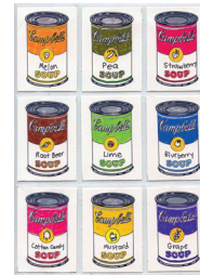
Warhol-inspired child art

Students will learn the art of design and use a variety of printmaking techniques, from simple stamping to printing on a press. They will have an opportunity to create a hand-bound book of prints or a wall hanging.