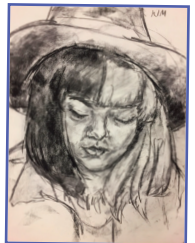
Portrait by Sanking Saephan

Learn about composition, perspective, light and shadow, depth, optical illusion, and generally how to compose and edit successful photographs. All students must have a smartphone capable of taking pictures or other digital camera.